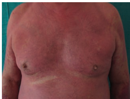
Figure 1. Confluent eruption of erythematous-violaceous plaques on the chest.

Lichenoid drug eruptions are commonly associated with gold, antimalarials, thiazides and phenothiazines. We should note that although the morphology of lichenoid eruptions is reminiscent of lichen planus, the following differences may occur: 3 i) beginning as hyperpigmented lesions or eczematous lesions; ii) do not present Wickham striae on