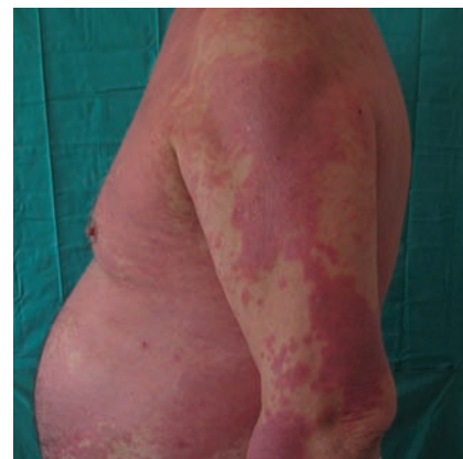
Figure 2. Cutaneous affection of the forearm.