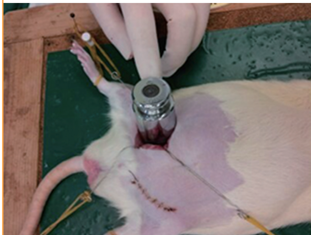
Table 1. Time needed for hemostasis

A puncture was made to the femoral artery and covered with a 1.5 cm × 1.5 cm piece of dressing material according to each group. A 200-g pendulum was then placed on top of the dressing material to apply pressure and removed after a 30-second interval to check whether the bleeding had stopped.