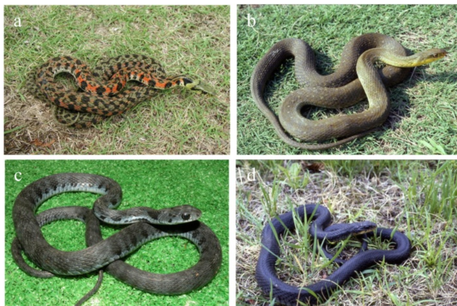
Figure 4 Color variation in yamakagashi from different geographical locations. Yamakagashi from (a) Kanto and Tohoku; (b) Chubu and Kinki; and (c) Chugoku and Sikoku; (d) melanistic variant.

As the venom is absorbed from the bite site, the platelet count gradually decreases due to the platelet aggregation activity of the venom, sometimes decreasing to <100,000/\text{mm}^3 [21]. Cases in which the platelet count rapidly