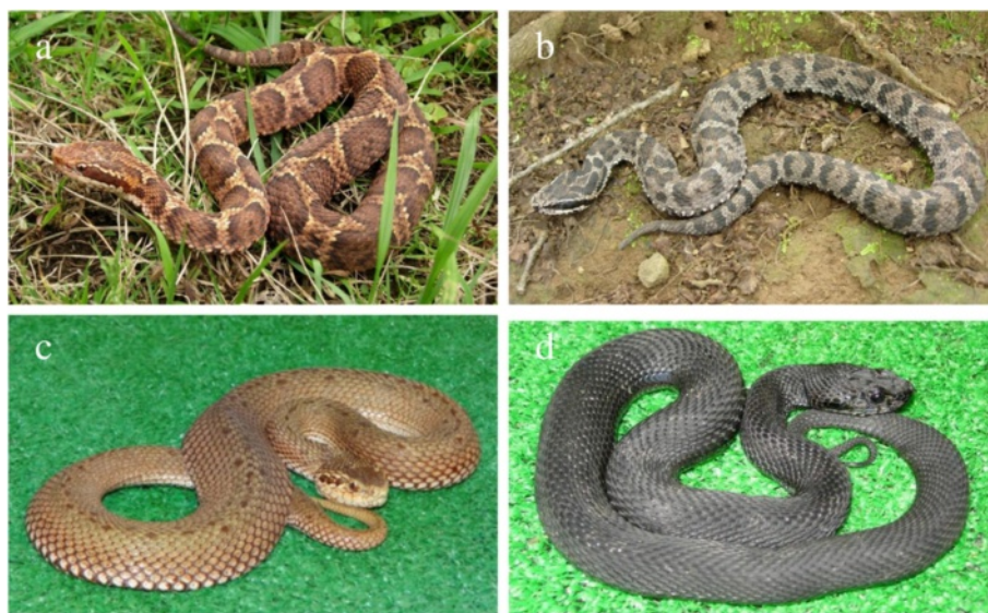
Figure 1 Color variation in mamushi. (a) Common color; (b, c) color variations; (d) melanistic variant.

Several enzymes, including a protease, phospholipase A2 (PLA2), and bradykinin-releasing-enzyme are contained in the mamushi venom [16]. The effects of these enzymes are described in Table 1. Local pain and swelling are the main symptoms at the bite site; subcutaneous bleeding and blisters are sometimes observed. The swelling and pain spread gradually from the bite site