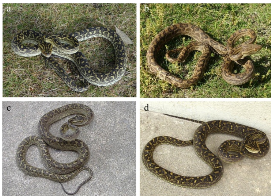
Figure 3 Color variations in habu from different geographical locations. Habu from (a) Amami Oshima; (b) Tokunoshima; and (c, d) Okinawa.

venom on the kidney can cause acute renal failure. In severe cases, the plasma potassium level can increase due to muscle tissue damage and metabolic acidosis, causing cardiac arrest shortly after the bite [18,19]. A rise in the level of the CPK isozyme cardiac muscle conformer (MB) and necrosis of the myocardium have been reported, which may be due to the direct action of venom on the cardiac muscle [20].