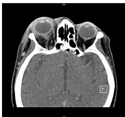
Fig. 1. Fat stranding and soft tissue swelling overlying the right globe anteriorly, which extends intra-conally and causes a mild degree of proptosis.