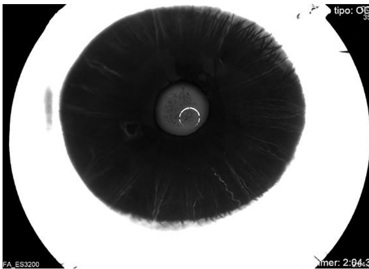
Fig. 3. Iris angiogram of the right eye.