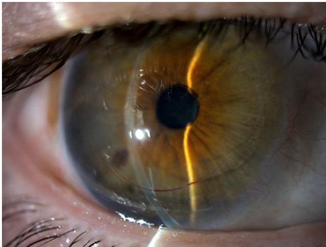
Fig. 1. Blood line deposited in the Haab stria of the right eye.