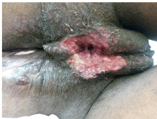
Figure 1 Ulcerated lesion in the perineal region, consistent with perianal Crohn's disease.

A 38-year-old, non-smoking female was diagnosed with colonic and fistulizing CD (Montreal Classification A2, L2, B3p) in 2006. A colonoscopy in 2012 revealed that, despite the use of infliximab (5mg/kg) and azathioprine (2mg/kg), the patient had superficial ulcers in the rectum and sigmoid. The patient had ulcerations in the vaginal lips and in the perianal region, including a perianal fistula and rectovaginal fistula. Curettage was performed on the entire raw surface. Passage of the seton showed improvement. In 2015, surgery of the rectovaginal fistula leads to complete restoration of the lesion. In February 2016, the patient presented with moderate clinical disease activity, bloody vaginal discharge, and pain