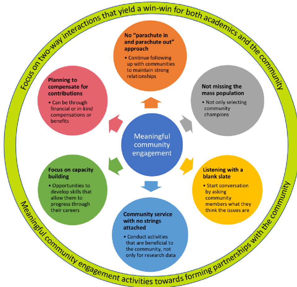
Figure 2 Components of meaningful community engagement.

who might be interested in joining us at any point in time. This approach helped us be in touch with a larger portion of the community. We implemented two approaches to reach the mass population. The first was through the community champions or influencers. We continually updated them on the progress of our work, and some were closely involved in the research process itself. Their buy-in of our work helped improve the perspectives general community members had concerning our initiatives. Second, we also took an active approach in disseminating information about our research. We proactively used social networking sites and ethnic media to advertise our events and activities. This also kept our work visible to the general community members.