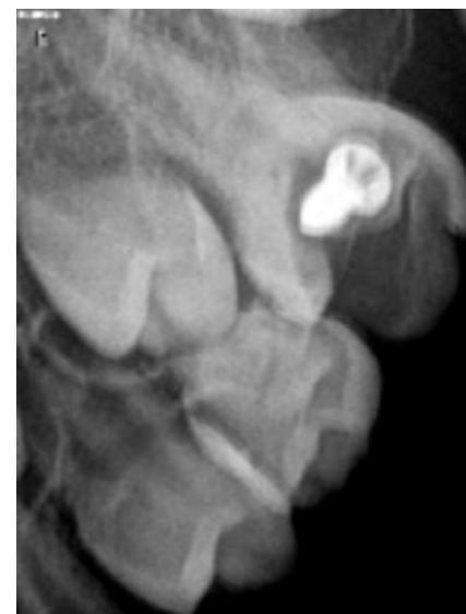
Figure 3. Intra-oral peri-apical radiograph showing a cylindrical foreign object packed tightly in the tooth.