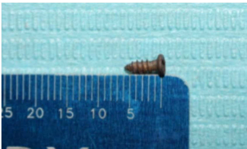
Figure 4. Image showing that the retrieved foreign body is a small screw.