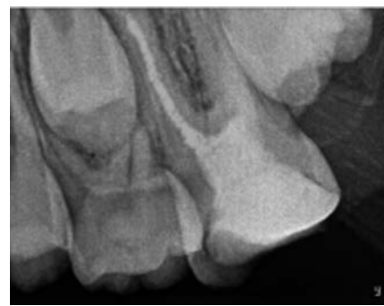
Figure 5. IOPA showing the tooth after treatment.