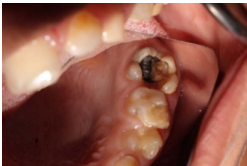
Figure 1. Clinical intraoral photograph of a patient showing an embedded foreign body in the permanent maxillary first molar.

endoscopic means. Rupture of the common carotid artery, esophageal tears and fistula, aortic pseudo-aneurysms, pericarditis and cardiac tamponade, all of which are very serious complications, have been reported. 2,4 Foreign bodies inside the tooth may act as a cause of infection and result in pain, bleeding, and swelling. Placement of jewelry into a maxillary central incisor resulting