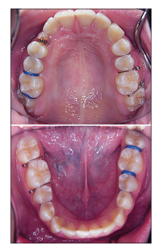
Figure 1: The elastomeric and spring separators in the patient's mouth

Following the placement of the separators, the patients were given the questionnaire. The patients were asked to answer each questionnaire after a proposed timing, i.e., 4 hours, 24 hours, 3 days, 5 days, and 7 days from the insertion time. The questionnaire was adopted and modified from earlier studies.<sup>[9,11,21]</sup> A visual analog scale (VAS) was included in the questionnaire [Figure 2]. The VAS was used to measure the severity of the pain. The patients were given two 1 cm long scales scoring 1–10 from no pain to severe pain; each scale representing one side, i.e., right/left. Majority of the patients had an understanding of VAS and could immediately formulate the measurement.