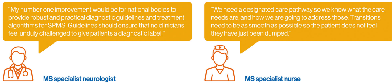
FIGURE 3 Respondent quotations highlighting the need for clearer and widely adopted guidelines to ease the transition to SPMS. MS, multiple sclerosis; SPMS, secondary progressive multiple sclerosis

Major theme: Substantial changes in healthcare resource use are acknowledged during and after the transition to SPMS.