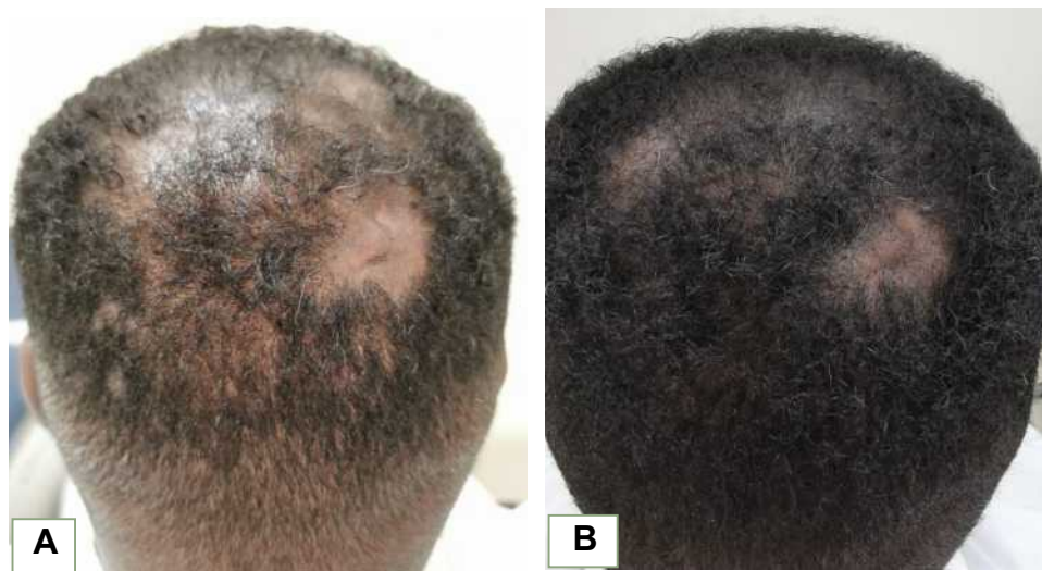
Figure 3 (A) Before treatment. (B) After 2 months of therapy showing partial hair regrowth.

adalimumab was started 80 mg on day 0, then 40 mg on day 7, and 40 mg weekly thereafter. Excellent response was noted after 1 month of therapy. The patient reported less pain and no more discharge. At 2 months follow-up, decreased swelling and areas of hair regrowth were noted which is unusual in the primary cicatricial alopecias (Figure 3). The patient continues to receive 40 mg adalimumab weekly.