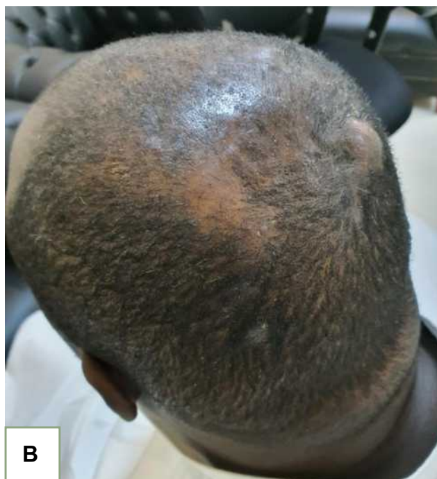
Figure 1 The patient with fluctuant, tender nodules with overlying alopecia. (A and B) Posterior and lateral views to show enlarged nodules in the scalp.