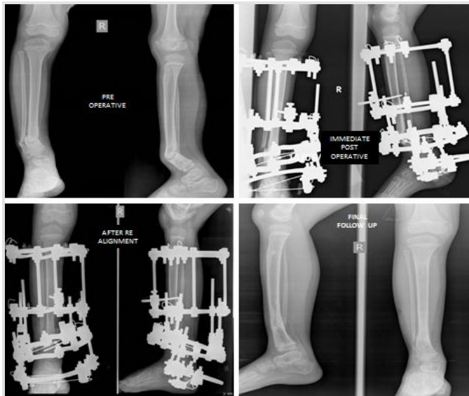
Figure 1: Pre-operative, post-operative, and follow-up radiographs of case 1 (male, 4 years)

(belonging to poor socioeconomic strata of the society) had traveled for long distances to come to our tertiary level referral teaching hospital and had difficulty with staying nearby our center for monitored adjustment of fixator postoperatively. Our strategy was devised primarily to shorten the “dynamic” phase of Ilizarov so that the children could return to their homes during the “static” phase, causing less economic and social stress to the family. All these children had hypertrophic nonunion of the tibia with significant multiplanar deformity and no shortening.