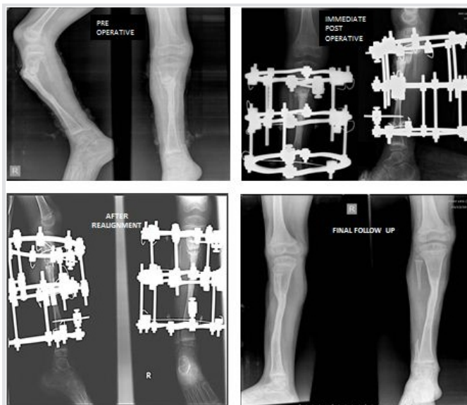
Figure 4: Pre-operative, post-operative, and follow-up radiographs of case 4 (male, 6 years, non-union of fibular graft)