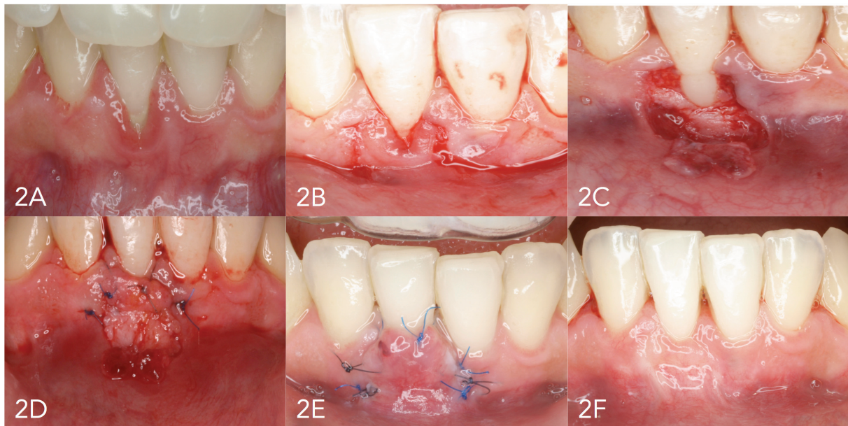
Fig. 2. 2A. Initial recession. 2B. Flap design. 2C. Raising of the partial thickness flap. 2D. Suturing of the connective tissue graft in the receptor bed. 2E. Flap suturing. 2F. Final condition after 18 months.

(and their variations) was homogeneous between the two study groups, i.e., to assess differences in the effect of the operation according to the surgical technique used. Lastly, an analysis was also made of the influence of other secondary variables referred to the patient profile, habits and clinical conditions upon the effects of the surgical treatment, with a view to identifying possible significant differences between the techniques. The two surgical techniques were seen to be applied indistinctly to patients with different profiles, habits and