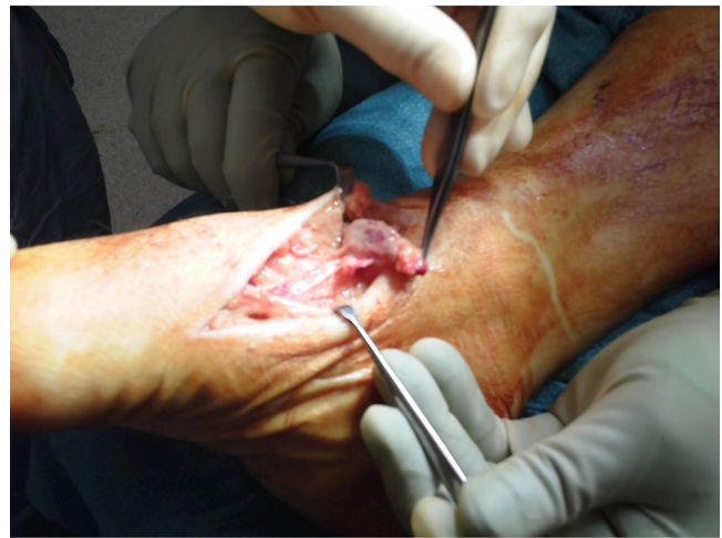
Fig. 3. Operative picture showing avulsion of tibialis anterior tendon.