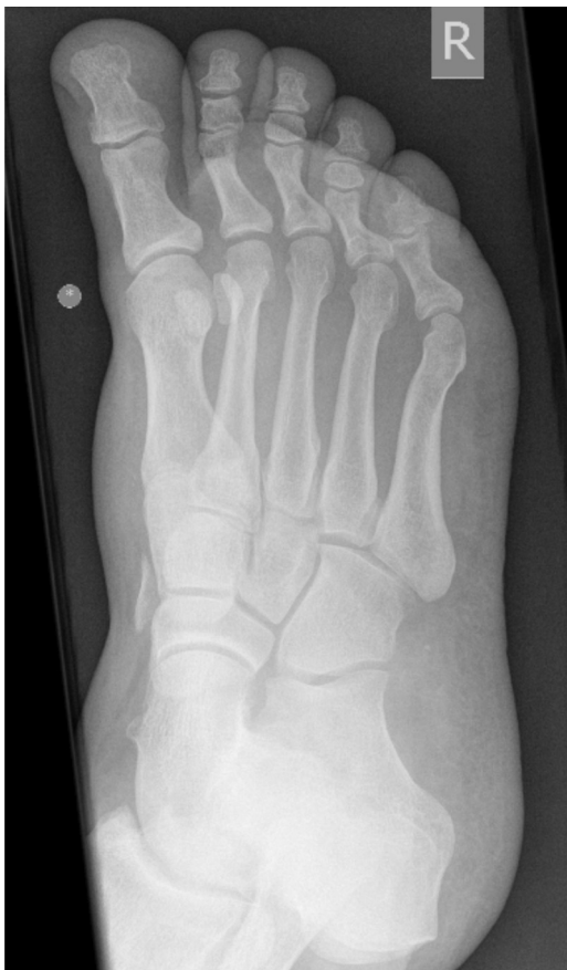
Fig. 1. Radiograph showing avulsion fracture from the medial cuneiform and base of first metatarsal.