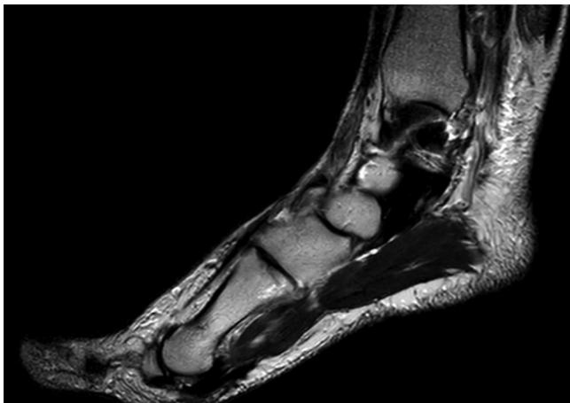
Fig. 2. MRI picture showing avulsion of tibialis anterior.