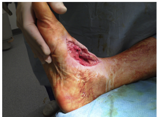
Fig. 5. Picture showing the final repair of the tendon after being attached to the base of first metatarsal.

of first metatarsal and medial cuneiform (Fig. 3). The tendon was mobilised and whip stitch applied to the avulsed end with ethibond sutures (Fig. 4). This was attached to the base of the first metatarsal with suture anchors and augmented with vicryl sutures, with his foot held in dorsiflexion (Fig. 5).