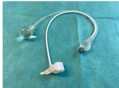
Figure 1 Victo adjustable artificial urinary sphincter.

To address these problems, we used a new one-piece artificial sphincter, Victo adjustable AUS (Promedon, Cordoba, Argentina), in men with SUI. The device is pre-connected and consists typical components of an AUS such as a urethral cuff (UC), a pressure regulating balloon (PRB) and a control pump, however it has a few innovative features ( Figure 1 ). All above is the self-sealing port in the pump for in situ pressure adjustments in addition, the device is also available as Victo + with an additional stress relief balloon (SRB), which is positioned between the cuff and the