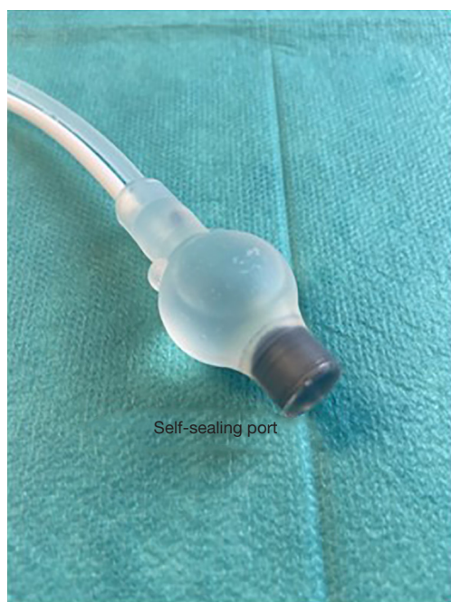
Figure 3 Pump with self-sealing port for in situ pressure adjustments.

0–100 cmH 2 O and can be altered by injection or removal of fluid (Aqua ad injectabilia). Adjustment can be done through the self-sealing port any time after implantation (Figure 3).