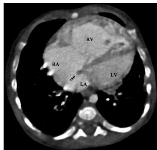
Figure 1. Figure 3 which subsequently drains to the LBCV and to SVC. The axial image through the cardiac chambers show a large ASD between the RA and LA facilitating a right to left shunt and making the condition compatible with life. ASD, atrial septal defect; LBCV, left brachiocephalic vein; LA, light atrium; RA, rightatrium; SVC, superior vena cava.

IAA: interrupted aortic arch was the second most frequent pathology of aorta with 12 cases (Figure 2). Isolated IAA was