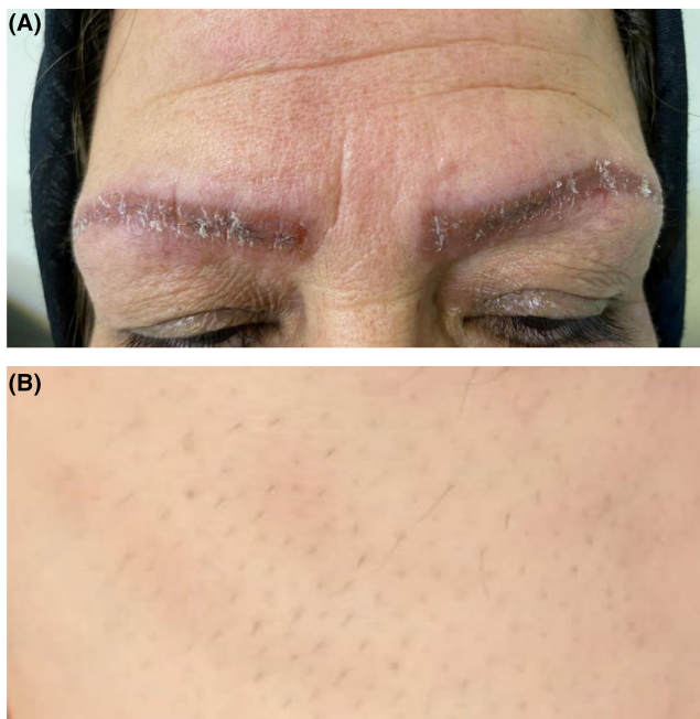
FIGURE 1 Exfoliating eruptions on the tattooed skin of the eyebrows, developed 1 week after receiving the second dose of SARS-CoV-2 vaccine (A). Symmetrical tender red nodules on the anterior aspects of lower legs (B)

Sarcoidosis is a multisystem granulomatous disorder with an immunologic basis, which is manifested as pulmonary, renal, ophthalmic, musculoskeletal, hepatic, and cutaneous complaints. Genetic, immunologic, and