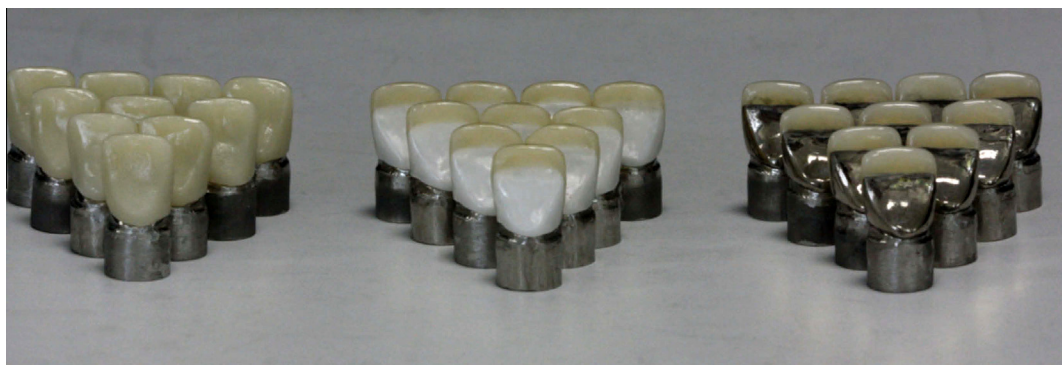
Figure 2 Three groups of specimens, from left: MO, VZ, and MC crowns cemented on the corresponding metal dies.

by using the silicone index made for the fabrication of the previous group of crowns.