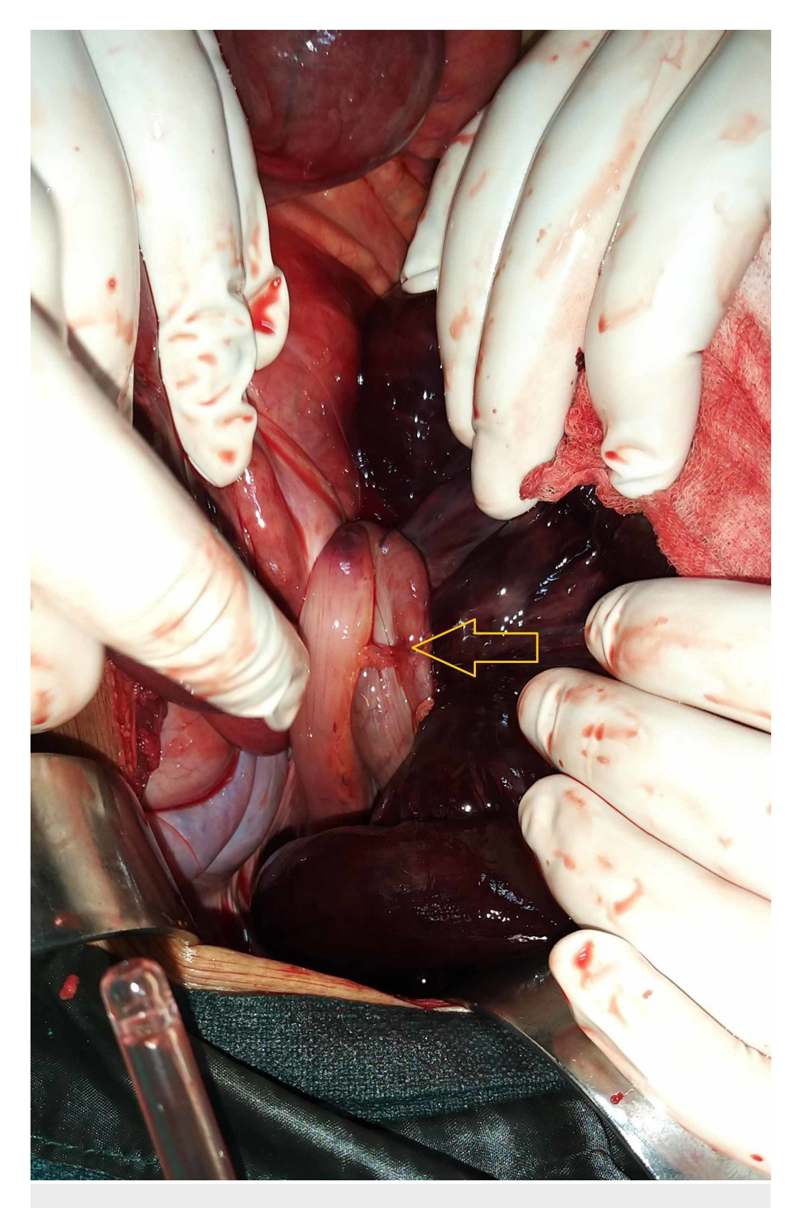
FIGURE 2: Intraoperative image showing the ileosigmoid knot (yellow arrow).