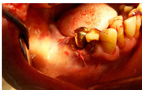
FIGURE 2: Wound condition after haemostasis and closure with a vestibular mucoperiosteal flap.

Activated partial thromboplastin time (aPTT); International normalised ratio (INR); Prothrombin time (PT).