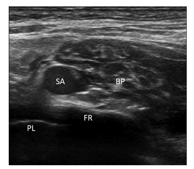
FIGURE 1. Even distribution of local anesthetics around the brachial plexus located lateral and cephalad to the subclavian artery after supraclavicular brachial plexus block. BP = brachial plexus; FR = first rib; PL = pleura; SA = subclavian artery.