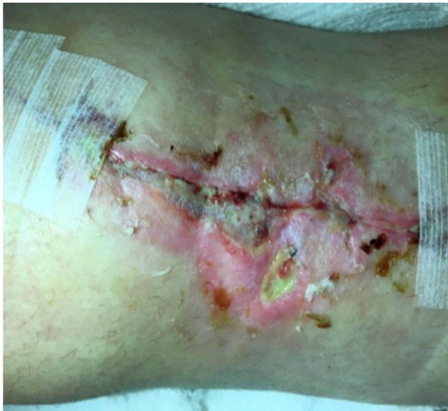
Figure 3. Wound 11 weeks post-op.

However, Eid et al. presented eight patients with nine infections due to rapidly-growing Mycobacteria (seven knees, one hip, one elbow), three of which were M. fortuitum [5]. Median onset of symptoms was 312 weeks after implantation (range 1-720). Two of these patients, both total knee arthroplasty patients, were treated with debridement and implant retention. The remaining patients all had their implants removed. The two patients with retained prosthesis received treatment with moxifloxacin, trimethoprim-sulfamethoxazole, and azithromycin or levofloxacin and trimethoprim-sulfamethoxazole for long-term suppression of M. fortuitum infection. Both were asymptomatic at 24 and 189 weeks after debridement, respectively. In our study, after one superficial and one deep wound debridement with an effort to preserve the initial prosthesis, the infection unfortunately could not be eradicated. The patient was treated with removal of the prosthesis with cemented stem preservation, and insertion of an