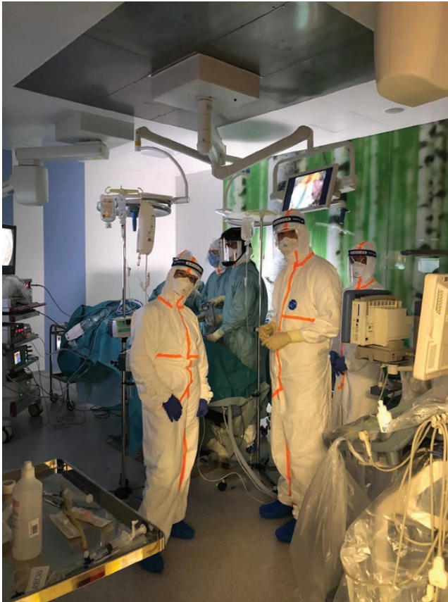
FIGURE 4. The COVID-19 operating room.

Our patient with ASUC and concomitant COVID-19 represented a significant management challenge. She developed a severe IBD flare requiring corticosteroid treatment, increasing the risk of a negative COVID-19 outcome. The persistence of COVID-19-related pneumonia and the progressive worsening of her IBD led to a prolonged hospital stay and several MDT discussions. The necessary colectomy, initially elective and then urgent, was hindered by infection complications, logistical difficulties, and the lack of real-world COVID-19 case studies to refer to.