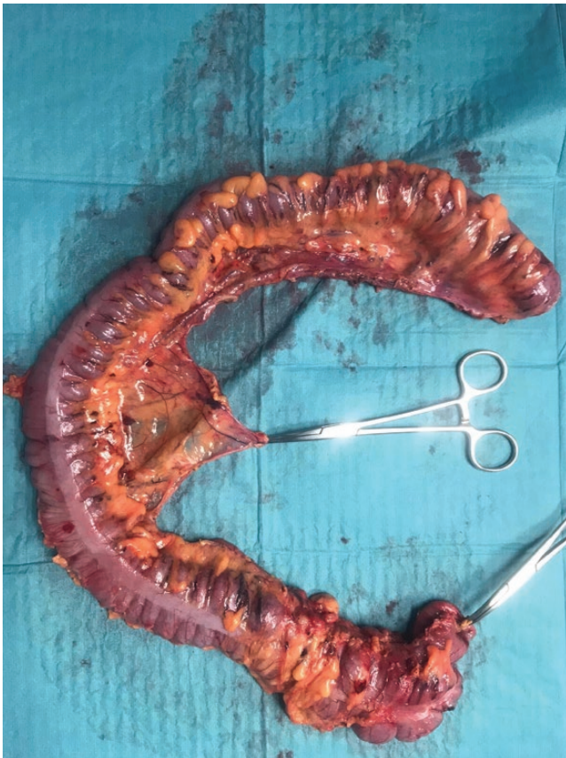
FIGURE 3. The colonic specimen after the urgent colectomy.