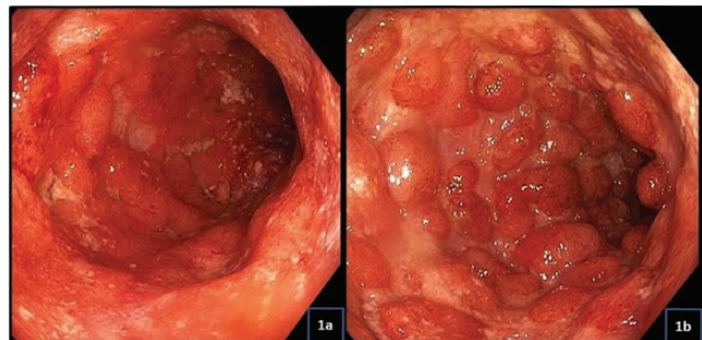
FIGURE 1. Endoscopic images showing severe inflammation features at admission (A) and after 5 days of intravenous corticosteroids (B).

In the absence of any COVID-19 surgery protocol, colectomy was repeatedly delayed because of