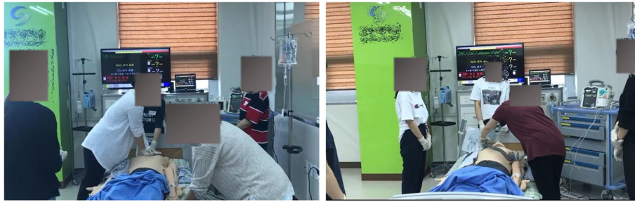
Fig. 1 Screenshots of recorded videos during skill performance evaluation

experiment. To confirm the pre-post change of the experimental group and the control group, the normal distribution was analysed by paired t-test, and the non-normal distribution was analysed using the Wilcoxon signed-rank test. The reliability of the measurement tool was analysed using Cronbach's alpha.