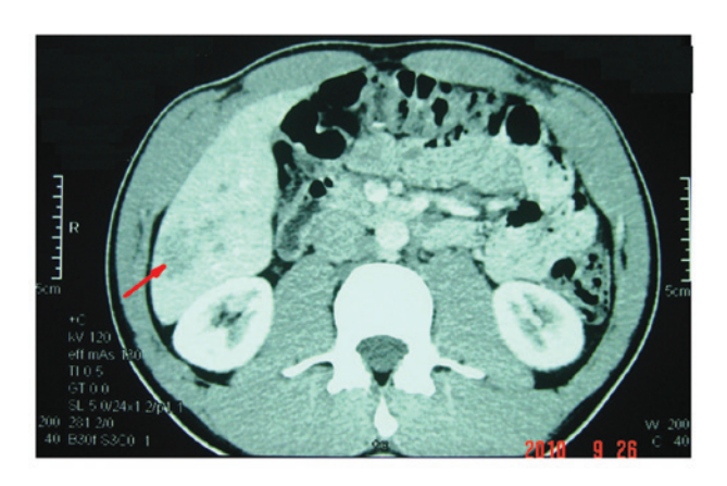
Figure 1. Computed tomography (CT) scan showing the Neoplasm (~3.5x4.5x4.5 cm) in the right lobe of the liver, as indicated by the arrow.