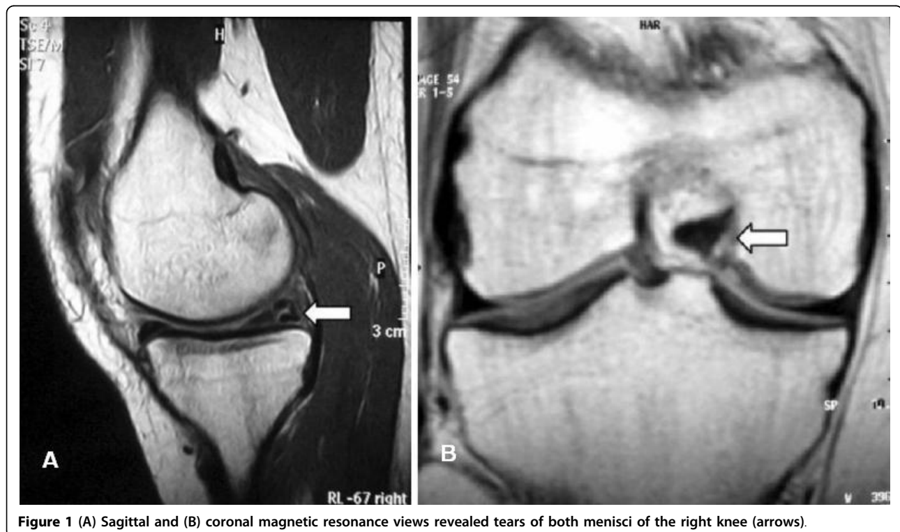
Figure 1 (A) Sagittal and (B) coronal magnetic resonance views revealed tears of both menisci of the right knee (arrows).

Bucket-handle tears are most common among soccer players. It is generally believed that there is no specific