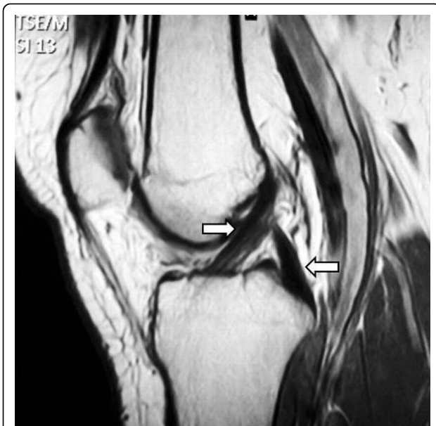
Figure 2 Magnetic resonance imaging evaluation demonstrated normal signal of both anterior and posterior cruciate ligaments (arrows).

mechanism of injury that could lead to this type of meniscal lesion. The fact that there are cases in which bucket handle tears occur without any history of injury to the knee joint, as in our patient, gives rise to theories that bucket-handle tears may be due to degenerative changes in the menisci [3].