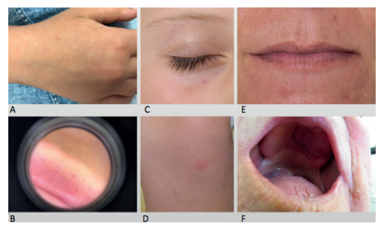
Fig. 2. (A) Bier spots and telangiectasia with white halo (P1). (B) Perioral telangiectasia through a dermoscope (P2). (C) Naevus araneus under right eye (P1). (D) CM on left knee (P1). (E) Perioral telangiectasia (P2). (F) Arteriovenous malformation in the palate (P4).

Cerebral magnetic resonance imaging (MRI) was performed as part of elucidation for hypothyroidism and did not reveal any cerebral AVM/AVF. In 2019 she received treatment for varicose veins on both legs and subsequently a tender prominent process was discovered in the popliteal region. A suspicion of AVM/AVF was raised, but an MRI scan did not confirm the suspicion.