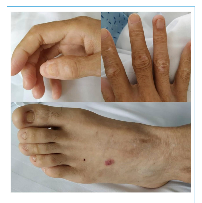
FIGURE 1 | Clinical manifestations of the patient's hands, feet, nails and skin: incomplete and deformed nails, skin scar.