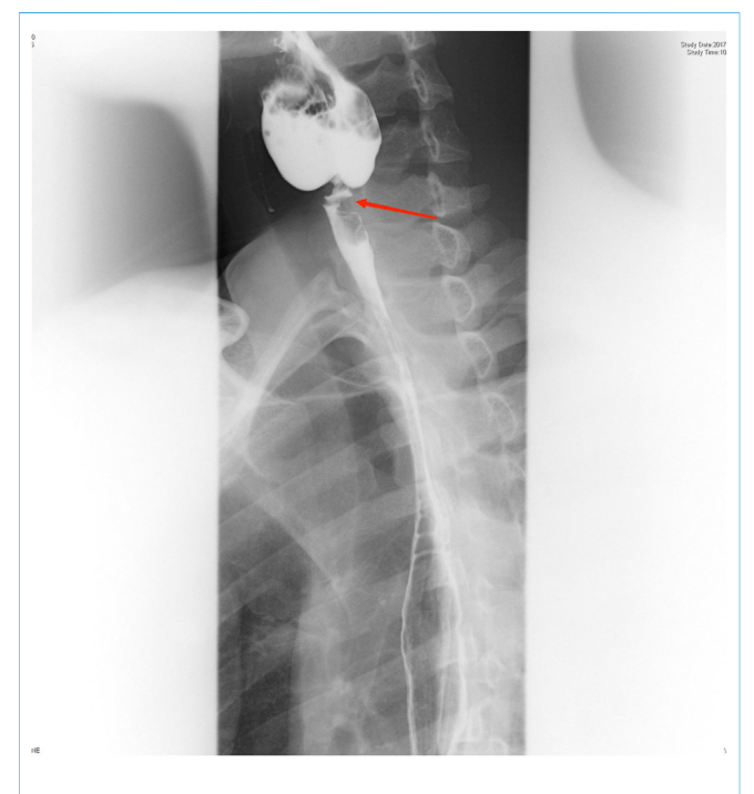
FIGURE 2 | Esophagus barium swallow test: the proximal part of the esophagus appeared severely narrowed at the level of the C6 vertebral body, and the esophageal lumen proximal to the stenosis was significantly dilated.

investigated with a barium swallow test (Figure 2) and electronic laryngoscopy (Figure 3), which demonstrated a severely narrowed hypopharynx-esophageal entrance. The