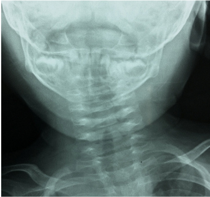
Figure 2: cock-robin position on anterior-posterior direct cervicography