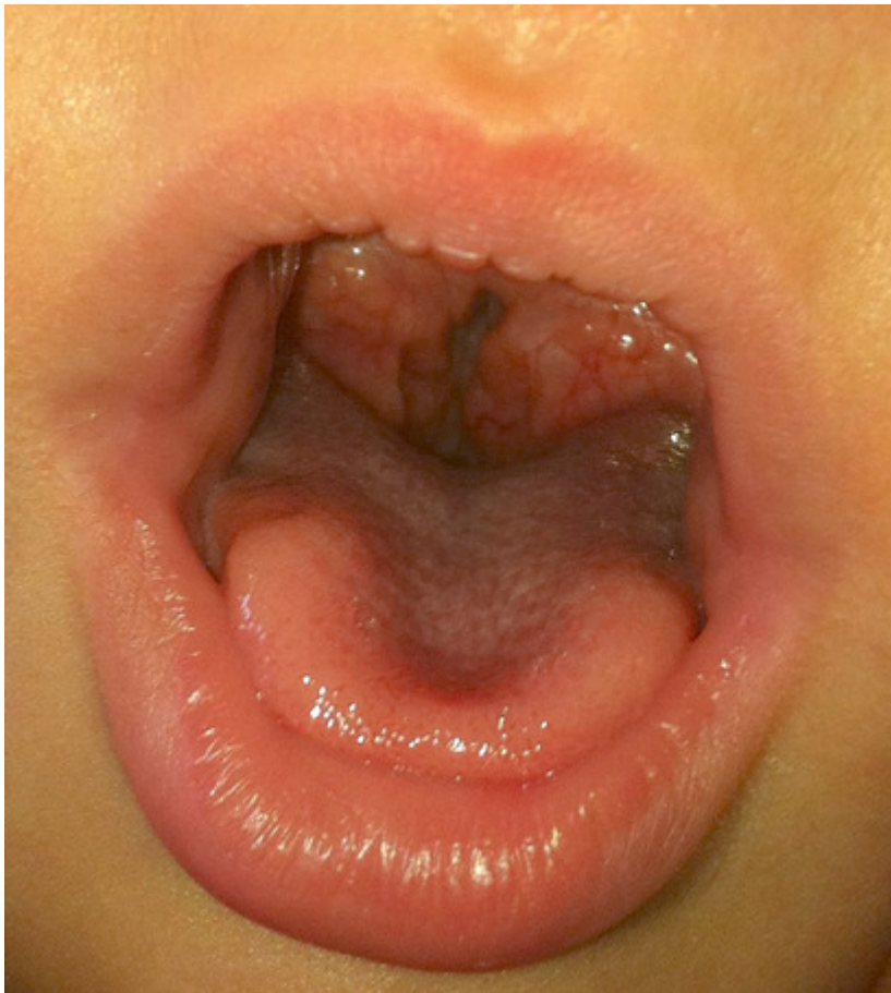
Figure 1: photo of the patient's throat following traditional uvulectomy