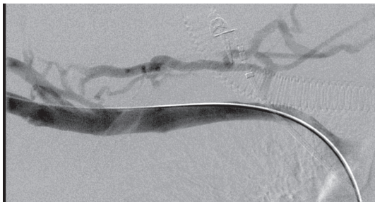
FIGURE 3: Digital subtraction venogram following PMT, showing complete recanalisation of the occluded subclavian vein.

Postthrombotic syndrome (PTS) is a complication of venous thrombosis and has recently been recognised in upper-limb DVT. With an overall incidence of 7%–46% [3], it comprises a constellation of chronic pain, paraesthesia, heaviness, and functional limitation which can significantly impact patients' quality of life.