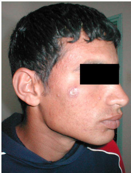
Figure 3. Dry and slightly inflammatory single lesion of the face due to L. tropica .

Most of the L. infantum -infected patients have a single, small, ulcerated, and crusty lesion on the face surrounded by a significant zone of infiltration (Fig. 4) [26].