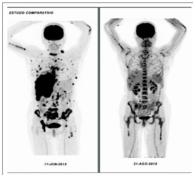
Figure 2. PET-CT, June and August 2013. Important metabolic response within 3 months of cancer treatment.

Following four cycles of oral capecitabine, the patient, who had previously been asymptomatic, now presented with paresis and spasms in the right lower limb. MRI of the