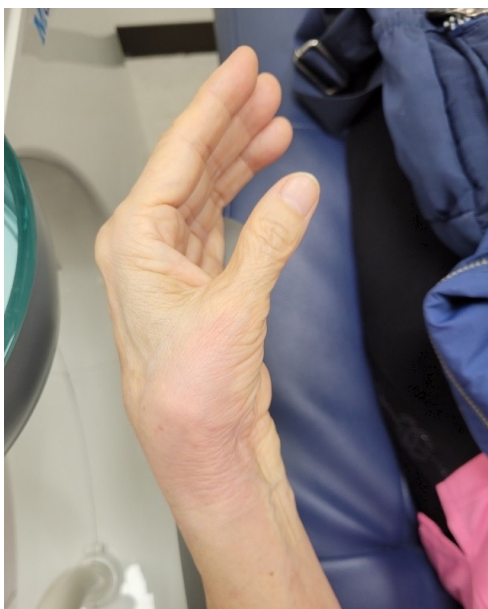
Fig. 1. Diffuse erythema and mild swelling on the left wrist and hand