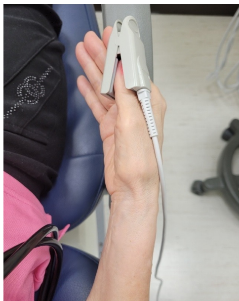
Fig. 4. Alleviated erythema on the right wrist and hand after intravenous injection of anti-histamine.

anesthesia, we hospitalized her in a daily care center and administered an intravenous injection of anti-histamine (Peniramin 4 mg) to alleviate her symptoms (Blood pressure 141/71, SpO 2 95, pulse rate 72). One hour after local anesthesia, the patient gradually recovered to a normal state (Blood pressure 139/74, SpO 2 100, pulse rate 70) (Figs. 3 and 4). Continuous monitoring of all vital signs was performed for an hour, and no signs of allergic reactions were noted. After confirming the patient's vital signs were normal and no typical allergic symptoms existed, the patient was discharged. She was instructed to report any discomfort or allergy symptoms to the emergency department. The following day, her symptoms, such as dizziness and itching, disappeared, except for pectoralgia.