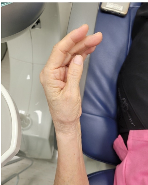
Fig. 3. Alleviated erythema on the left wrist and hand after intravenous injection of anti-histamine.