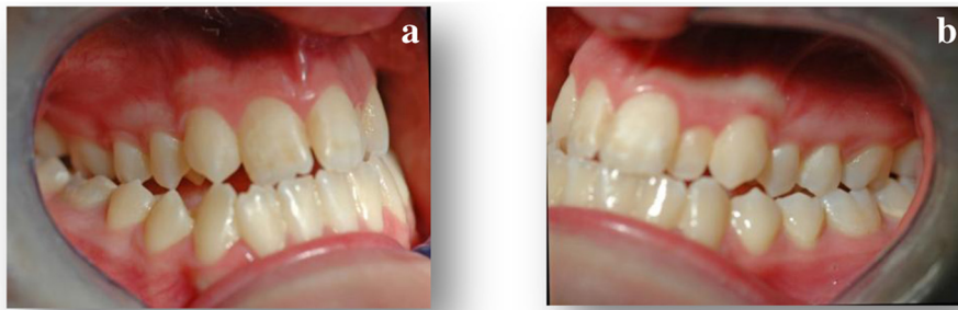
Figure 1 (1a, 1b) Intra-oral pre-expansion photographs.

class III malocclusion with transverse maxillary deficiency (Figures 1 and 2).