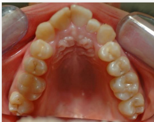
Figure 2 Occlusal pre-expansion photograph.

An ophthalmologic examination was performed according to the guidelines of the American Optometric Association [7] and included the visual acuity assessment, both in natural and cycloplegic (tropicamide 1%) position, funduscopy examination, alternate CT, Berens prism test, NPC, fusional convergence, Lang II stereotest, Worth 4-dot test and the evaluation of MOE function. The alternate CT is used to detect the presence of evident (heterotropia) or latent (heterophoria) ocular deviation: the patient is asked to fix a straight ahead target, at distance, near and in different gaze positions, while the examiner occludes one of the patient's eyes with an opaque card or paddle; by observing the