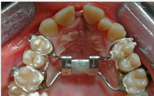
Figure 4 Occlusal photograph after expansion with rapid maxillary expansion appliance.

Many studies based on histologic methods, radiologic imaging, photoelastic models, bone scintigraphy and