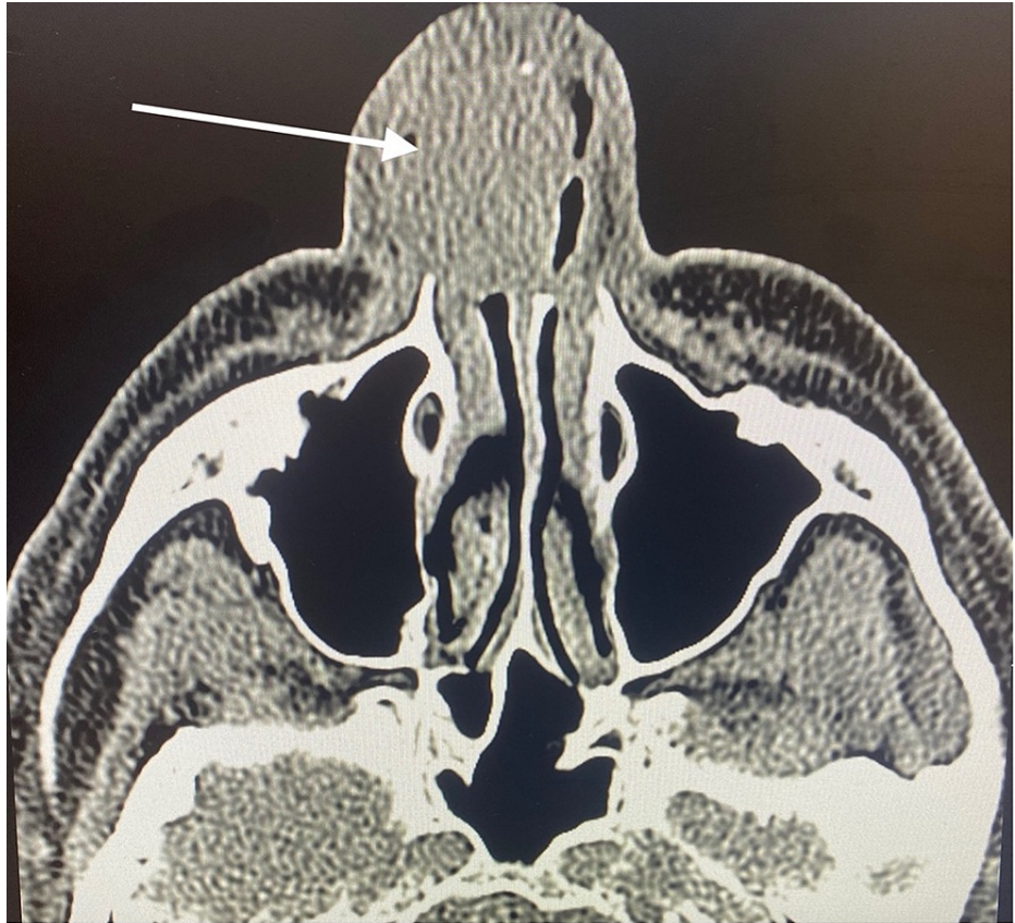
FIGURE 1: Axial CT scan without contrast at the level of the maxillary sinus in soft tissue window depicting the erosive, right sided nasal mass arising from the cartilaginous septum (arrow).

The patient was ultimately taken to the operating room for nasal endoscopy and excision of the right-sided nasal mass. Intra-operatively, a 5 x 4 cm mass as previously described was visualized which originated from the anterior and midportion of the septum. Due to an inability to access the posterior margin of the lesion, excision was only feasible through the contralateral nostril. A left-sided hemi-transfixion incision was made and a mucoperichondrial flap was extended backward past the bony-cartilaginous junction. The mass was noted to have eroded through the septum but was not involving the vomer or perpendicular plate of the ethmoid. After disarticulating the bony-cartilaginous junction and freeing the septum from pre-maxillary crest the lesion was removed in its entirety from the right nasal cavity. Pathologic examination of the specimen demonstrated a lesion with both epithelial and sarcomatous components (Figure 2) which stained positively for cytokeratin 5/6 (CK 5/6), Cam 5.2, P40, and epithelial membrane antigen (EMA). The final pathologic diagnosis was carcinosarcoma. The patient opted against an elective neck dissection and instead chose to pursue chemoradiation therapy for the right-sided neck mass.