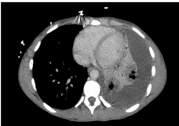
Figure 3. CT chest showing large pleural effusion on left representing empyema. Multiple pulmonary nodules showing cavitation are probably septic emboli.