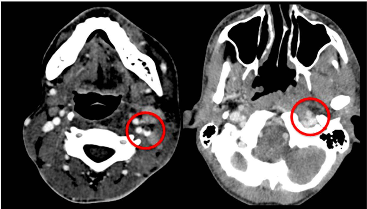
Figure 2. CT of the head and neck showing thrombosis of the left pterygoid venous plexus leading to internal jugular vein filling defect.