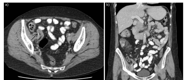
Figure 1. CT abdomen with intravenous and oral contrast demonstrating enlarged appendix, found to be appendiceal endosalpingiosis on histopathology of appendicectomy specimen, in (a) axial section and (b) coronal section. Arrows to enlarged appendix.

A 56 year old woman presented to emergency with seven days of abdominal pain. Her pain was initially dull and within the peri-umbilical region before migrating to the right iliac fossa and becoming sharp and constant. The pain was associated with subjective fevers and anorexia. There were no bowel or urinary symptoms reported. The patient was post-menopausal and before presentation was previously well with no significant past medical history; her only surgical history included two lower segment caesarean sections. She was seen by her general practitioner who arranged for an outpatient CT of the abdomen and pelvis with oral and intravenous contrast, undertaken on day six of symptoms. CT findings demonstrated a thickened appendix measuring up to 11 mm, reported as consistent with acute appendicitis. There was no significant fat stranding, intraperitoneal free fluid, nor gas, and the CT was otherwise unremarkable (Fig. 1). Upon presentation to emergency, examination found a clinically stable patient with tenderness in the right iliac fossa and suprapubic regions, particularly over McBurney's point. Rosving's sign was negative. White