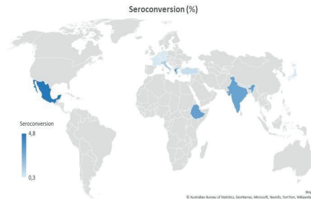
Figure 3. The seroconversion of TG During pregnancy

derwent their first screening in the first trimester, 30.4% in the second and 14.9% in the third trimester of pregnancy, while the CT was excluded in all infants (38). In Austria, a country in a group of countries that also include systematic Toxoplasmosis screening, moderate seroprevalence is observed, according to a survey by Prusa et al., 2017 (36), prenatal screening is mandatory, and this results in significant cost savings from the effects of CT. However, 8 cases of CT occurred per year but, infants with TG infection did not show any clinical signs.