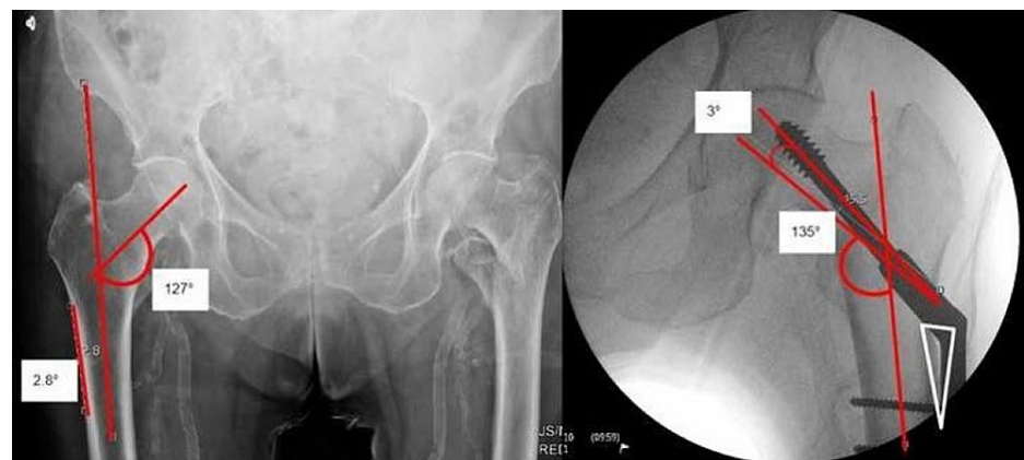
FIGURE 1: The angle between the femoral anatomical axis and the greater trochanter flare is shown on the left. The screw-plate angle was measured, which was \geq 135^\circ , resulting in a 'sail sign' when the fixed-angle barrel-plate was placed on the femoral cortex

The data were tested for normality. The student's t-test was performed on GraphPad Prism version 7.03 (GraphPad Software, Inc, San Diego, CA).