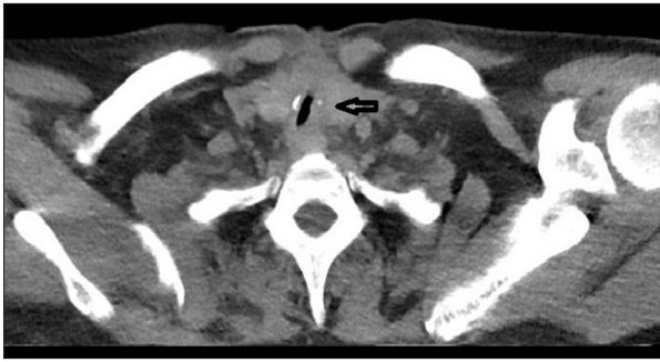
Figure 1. Case 1. Lung computed-tomography (CT) image from a 54-year-old man with coronavirus disease 2019 pneumonia who required tracheostomy for mechanical ventilation. Ten days after hospital discharge, the patient returned with respiratory distress. The CT scan shows tracheal stenosis (arrow) with clear lung fields.