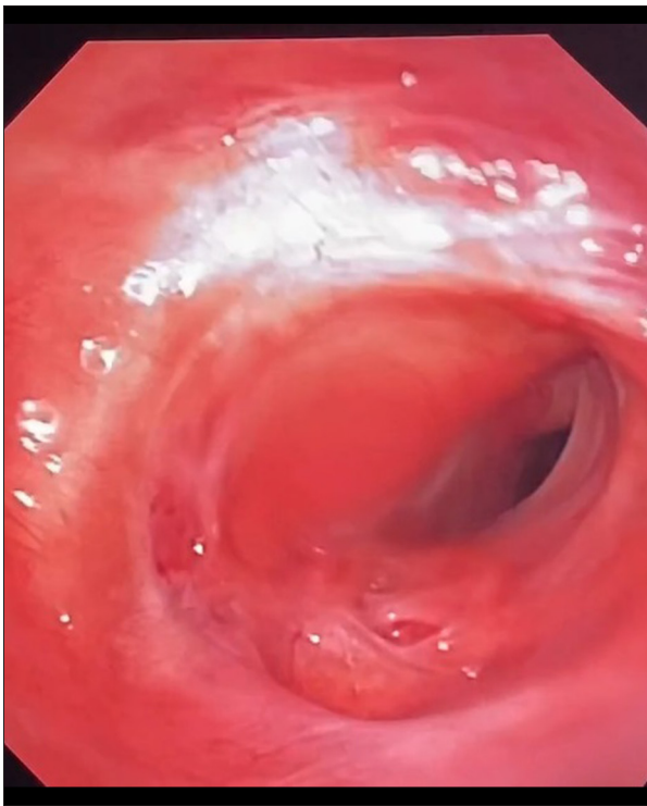
Figure 2. Case 1. Bronchoscopic image from a 54-year-old man with coronavirus disease 2019 pneumonia who required tracheostomy for mechanical ventilation. The bronchoscopy shows the tracheal stenosis that occurred 10 days after hospital discharge.

Eighteen days later, the patient was brought to our emergency room with severe respiratory distress. CT scan and bronchoscopy were performed; signs of tracheal stenosis were visible (Figures 3, 4). We administered intravenous infusion of 80 mg/day of 6-MP for 10 days. The patient did not show any improvement in his breathing function and had to undergo tracheal resection.