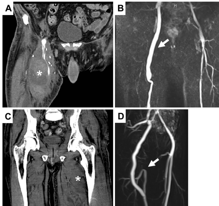
Figure 1 (A) Computed tomography scan of case 1 obtained after rebleeding due to septic pseudoaneurysm showing liquid, putrid formation (asterisk) with arterial extravasation caused by erosion of the distal anastomosis of the greater saphenous vein interposition and extensive perifocal soft-tissue edema in the right upper thigh. (B) Magnetic resonance angiogram of the obturator bypass in case 1 nearly 3 years after bypass surgery showing bypass perfusion free of stenosis (arrow). Case 2 (C) Computed tomography scan of case 2 at time of admission showing swelling, subcutaneous purulent formation and perifocal edema (asterisk). (D) Magnetic resonance angiogram obtained 3 months after surgery in case 2 showing the obturator bypass with retrograde perfusion of the profunda femoral artery by additional end-to-end anastomosis with proximal superficial femoral artery (arrow).

together with rhabdomyolysis and sepsis with liver and kidney failure (Figure 1C). Massive gangrenous destruction of the femoral vessels and surrounding tissue were found intra-operatively, pending sufficient coverage of an orthotopic revascularization (Figure 2A). Group B Streptococcus was identified.