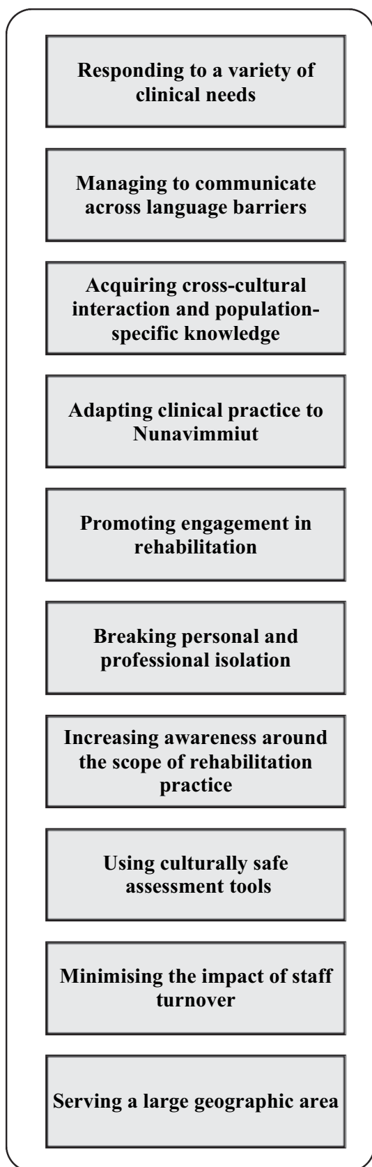
Figure 2. Overview of the 10 major themes of the reflective process.

challenges may also impact on the establishment of rapport and engagement in therapy [21,26].