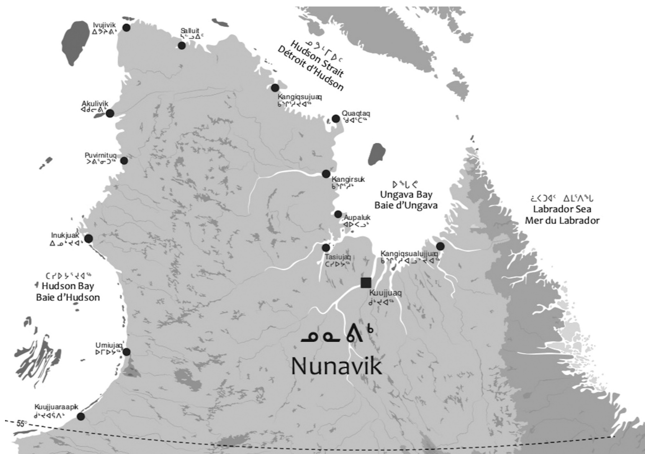
Figure 1. Map of Nunavik. *Authorisation to use this map received by the authors.[20].

Nunavik is one of the four Inuit land claim regions that comprise Inuit Nunangat. The population of Nunavik is 13,188, including 11,795 Inuit [14,15] who live in 14 communities with populations ranging from 210 to 2755 [16] (Figure 1). Health care in the region is administered by the Nunavik Regional Board of Health and Social Services, an Inuit-governed public institution developed under the James Bay and Northern Quebec Agreement [17]. Services are provided by professionals who generally come from southern Quebec and who