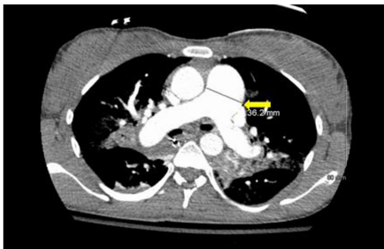
Fig. 2 CT scan of the chest with contrast. The yellow arrow depicts enlarged main pulmonary arterial trunk

In order to identify the cause of her VTE the patient had further work up including thrombophilia testing and CT chest, abdomen/pelvis. Thrombophilia testing revealed the patient to be wild type for Factor V and Prothrombin gene. Protein C and S antigen levels were normal. Antithrombin activity was initially low (71, normal range 75–125 % ACT) at the time of initial VTE but subsequently normalized (107). Antiphospholipid antibody testing including lupus anticoagulant, anti-cardiolipin antibodies and beta 2 glycoprotein I antibodies was negative. CT chest, abdomen and pelvis showed constellation of imaging findings compatible with heterotaxy syndrome. These included left-sided superior vena cava (SVC) draining into the left coronary sinus, hemiazygous vein drains into left SVC, absent azygous vein, absent (interrupted) inferior vena cava (IVC) below the hepatic IVC with persistent left IVC which drains into left coronary sinus, polysplenia, bilateral left lung and benign hepatic hemangioma (Fig. 3A-C).