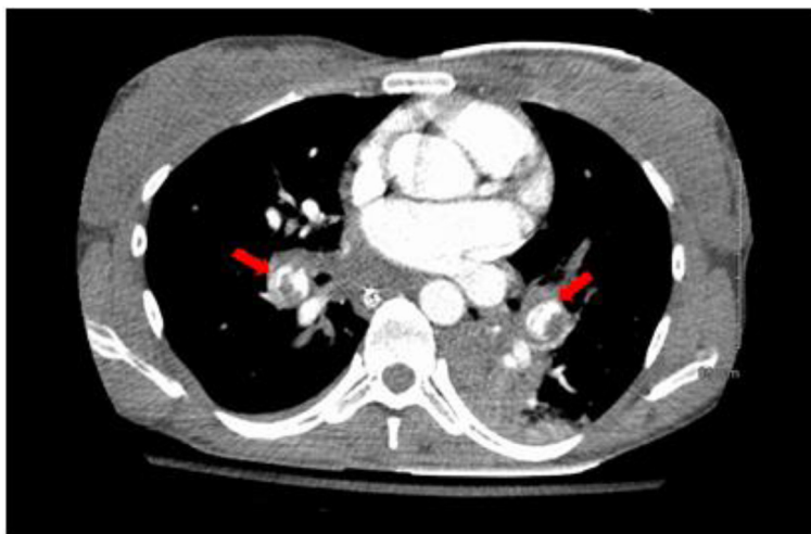
Fig. 1 CT scan of the chest with contrast. The red arrows depict bilateral near occlusive pulmonary emboli

At approximately 20 week's gestation, the patient had a fetal ultrasound that revealed singleton gestation with massive hydrops, fetal contractures and ventriculomegaly/hydranencephaly. It was presumed that these findings were secondary to early hypoxic injury and she was counseled about poor prognosis. During her 25th week gestation, the patient noted worsening abdominal pain with associated headaches, lightheadedness and weakness. She had elevated blood pressures and was suspected to have mirror syndrome. Enoxaparin was discontinued 24 h prior to the planned procedure with initiation of UFH drip. The patient underwent elective induction of labor with palliative care services. The infant died shortly after delivery. The patient experienced increased vaginal bleeding secondary to retained products of conception and underwent dilatation and curettage with achievement of hemostasis. Enoxaparin at previous dosage (55 mg s/q twice daily) was restarted 24 h after the delivery without any major or untoward complication. Platelet count and anti-Xa levels were checked while the patient was on enoxaparin. Anti-Xa levels were in therapeutic range (0.8–1, goal 0.6–1.0 IU/ml) and platelet counts remained within normal limits.