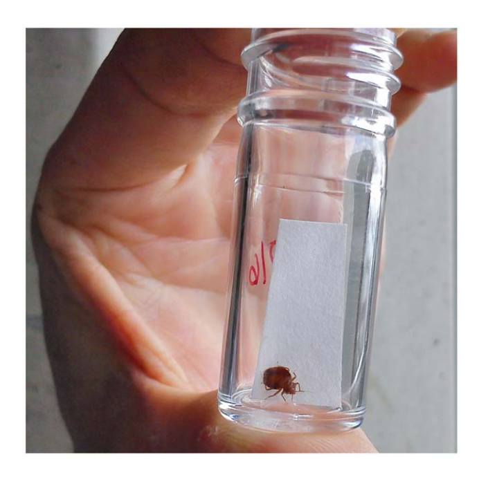
Figure 1. Male bed bug in a test tube as presented to people in an inquiry about bed bugs.

Fifty per cent of the interviewees had no idea what they were presented with or, occasionally, did not want to reveal their thoughts. One quarter suggested it to be a tick (Figure 2). Three people stated they recognized a ladybird (all of them adults - aged 18, 43 and 50). The breakdown of responses (Figure 2) also indicates that many people cannot correctly recognize ticks, cockroaches or lice. The term "beetle" was considered incorrect despite the superficial resemblance with bed bugs. Other responses included mite (2), woodlouse (2), scale insect (1), and cockchafer (1).