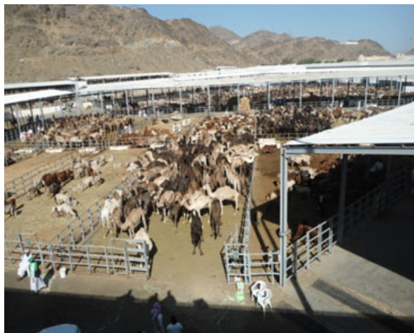
FIG. 2. Herd of camels at the Hajj site in Mina, Makkah.

reported to have an active infection (i.e. PCR positive), whose owner was also infected [13]. Bats have been suspected as a possible source for the MERS-CoV with part of the genome