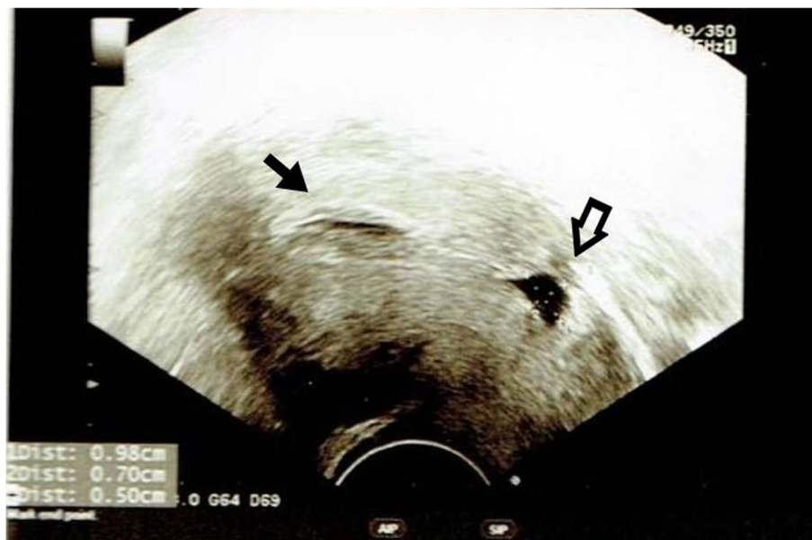
Fig. 1 An ultrasonographic picture showing a sagittal view of the uterus and cervix. The left arrow indicates fluid accumulation in the uterine cavity, and the right arrow indicates a lesion measuring 9.8 × 7.0 mm at the lower uterine segment - a Caesarean section scar defect. A remaining myometrium thickness of 5 mm was measured

before withdrawal for bacterial isolation. Bacterial cultures of the endocervical canal approximately 2–3 cm proximal to the external os from subjects in Groups B and C were also obtained from Day 7 to Day 10 of the follicular phase. All ultrasonographic examinations and swabs taken were performed by the same investigator (C.C. Hsu). Collected samples were incubated at 35 °C overnight with appropriate media including BAP/EMB Biplate (BBL™ Trypticase™ Soy Agar with 5% Sheep Blood/Levine EMB Agar, BD), BD Chocolate agar plate (GC II Agar with IsoVitaleX and Blood Agar No. 2 Base), Chrom ID™ Candida Agar (CCA, bioMérieux, Marcy-l'Étoile, France), a CNA agar plate (BD Columbia CNA Agar with 5% Sheep Blood), and Thio broth CDC AnBAP PEA agar plate (BD BBL™ CDC Anaerobe 5% Sheep Blood Agar with Phenylethyl Alcohol). Once the culture was identified to be positive, Gram staining and subculturing were undertaken. BAP/EMB Biplates and Gram staining were used for bacterial strain identification. The disk diffusion antimicrobial susceptibility method was used for antibiotic susceptibility tests. Specific antibiotics were given to the positive bacterial strains identified. Repeated cotton swab samplings were taken for microbiology tests under consent in some participants who did not conceive after 3–6 months of follow-up. The primary outcome of the present study was the identification of the presence and