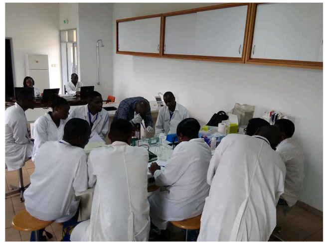
Fig. 2. Hands-on on Western blotting procedures at the 2018 IBRO school in Cameroon.

Through this sponsorship, the biochemistry and physiological science laboratory at the school of Medicine was equipped to conduct research at molecular levels to study structural neuronal changes and examine protein expression. Currently there are four PhD students at this laboratory whose studies have incorporated immunohistochemistry, western blotting and RT-PCR to investigate the effects local