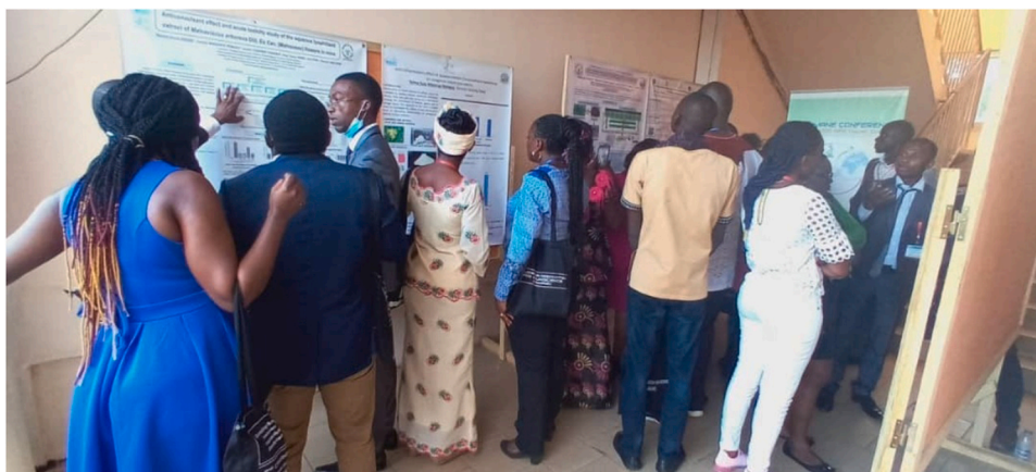
Fig. 3. Poster presentation at the 2nd Cameroon Association for Neuroscience conference in Yaounde, 13th – 15th October 2020.

Currently, the government of Cameroon sends resident doctors on foreign exchange programs each year for neurological specialization to