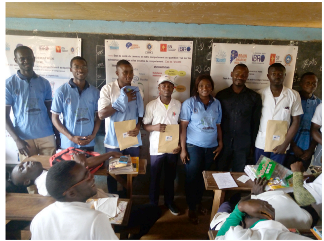
Fig. 4. CAMANE organized Brain Awareness Week.

At the university level, training programs in neuroscience are still a rarity in Cameroon. Despite the fact that there are over 15 public and private registered higher education institutions in Cameroon, only one clinical neuroscience program and one basic neuroscience graduate degree program are offered in the whole country (neurology and basic neuroscience at the University of Yaounde 1). This severely limits the