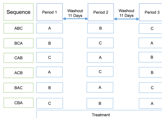
Figure 1. Study design; treatment A, atorvastatin 40 mg once daily for seven days; treatment B, ezetimibe 10 mg once daily for seven days; treatment C, co-administration of atorvastatin 40 mg and ezetimibe 10 mg once daily for seven days.

Plasma concentrations of atorvastatin, 2-hydroxyatorvastatin, total ezetimibe (free ezetimibe + ezetimibe-glucuronide), and