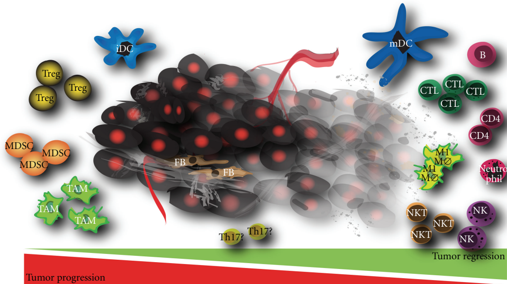
FIGURE 1: Interplay between immunological cells that inhibit tumour growth on the right of the tumour and cells that aid in tumour progression on the left. (Tumour is depicted as black cells with a red nucleus in the middle.) iDC: immature dendritic cell, Treg: regulatory T cell, MDSC: myeloid-derived suppressor cell, TAM: tumour-associated macrophage, mDC: mature dendritic cell, B: B cell lymphocyte, CTL: cytotoxic T lymphocyte, M1 MØ: M1 macrophage, NK(T): natural killer (T) cell, Th17: helper T lymphocyte 17, FB: fibroblast.

promising [16–18] and therefore progressed to clinical trials. CAT-5001, administered to mesothelioma patients, among other cancer types, showed only modest clinical responses [17, 18]. Amatuximab failed to demonstrate any radiological responses in a phase I trial in mesothelioma and other cancer types [19]; however preclinical studies demonstrated significant antitumour efficacy using combination of amatuximab and chemotherapy treatment [20] justifying a multicenter phase II clinical trial utilizing cisplatin/pemetrexed with amatuximab in mesothelioma patients. This trial has been completed and results are expected soon. More recently a phase I study of SS1(dsFv)PE38, a recombinant antimesothelin immunotoxin, was commenced which is ongoing at this moment (ClinicalTrials.gov Identifier: NCT00575770).