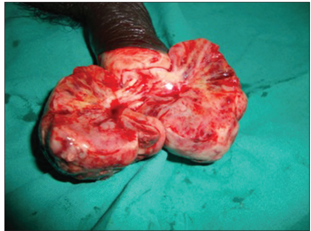
Figure 2: Bivalved specimen showing corporal invasion

and mostly at the periphery of tumor nodule. [4] A pyronie's disease should also be further excluded in patients with acutely changing subcutaneous plaques. [5]