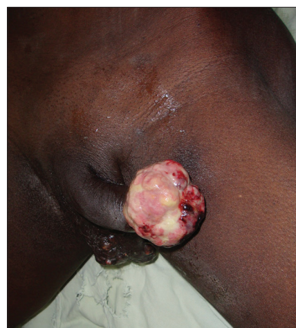
Figure 1: Fungating growth of penis with scrotal sebaceous cyst and left inguinal lymphadenopathy

negative. Patient underwent emasculation with total penectomy with bilateral scrotoectomy with perineal urethroostomy. As sarcomas metastasize mainly through hematogenous route, inguinal lymph node dissection was not performed. However, fine-needle aspiration cytology of the left inguinal lymph node was performed in the same sitting, which suggested reactive hyperplasia. There were no post-operative complications and patient was discharged from the hospital on the 6 th post-operative day.